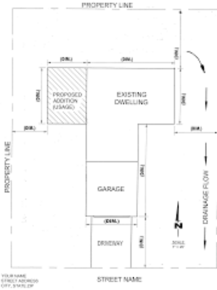
RESIDENTIAL ADDITION PLOT PLAN EXAMPLE