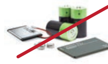
NO Batteries – check local drop-off programs for proper disposal