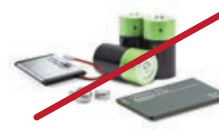
NO Batteries – check local drop-off programs for proper disposal