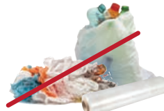
NO Loose Plastic Bags, Bagged Recyclables or Film Empty recyclables directly into your cart