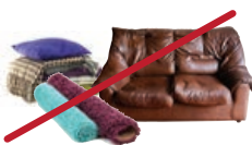
NO Clothing, Furniture & Carpet

To Learn More Visit: wm.com/recycleright