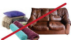
NO Clothing, Furniture & Carpet

To Learn More Visit: wm.com/recycleright