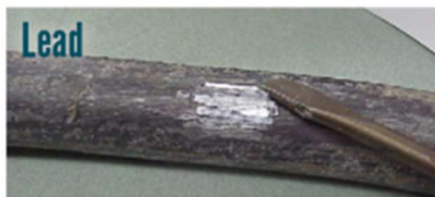
You have a lead pipe if...

If you have any questions, please call the Water Plant @ 937.845.3059 or the City Office @ 937.845.9492.