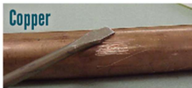
You have a copper pipe if...

The Scratch Test ...the scraped area is shiny and silver.