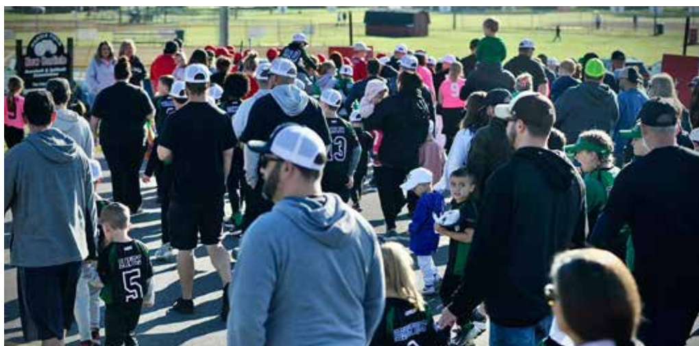
Haddix Field Opening Day

As New Carlisle continues to grow at a pace not seen in decades, Haddix Park remains a vital part of the community. It is important that the City and NCBSA continue working together to improve the park and enhance the experience for players, families, and visitors.