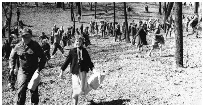
Easter egg hunt in the 1950's