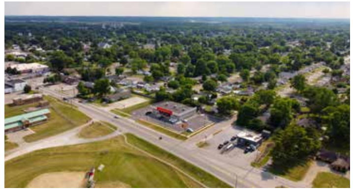
New Carlisle circa 2020

History doesn't repeat itself exactly, but it often repeats in rhythm. We have been here before.