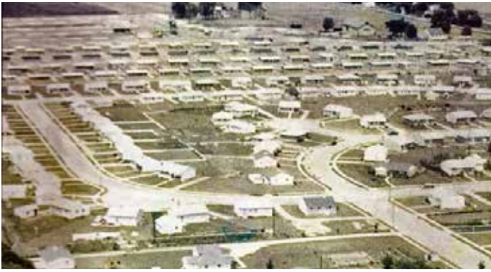
New Carlisle circa 1950-1960

shifted, and the overall demographic profile reflected an older population.