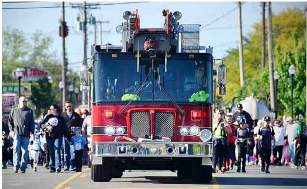
NCBSA Opening Day Parade.

Recent improvements include upgraded dugouts on three of the five fields, with plans to complete the remaining upgrades before the